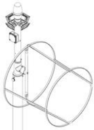
STYLE I-A: EXTERNALLY LIGHTED