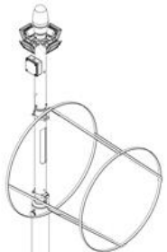
STYLE I-AB: DOUBLE LIGHTED